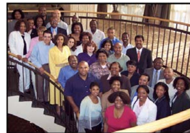
MFCA members at the 2005 MFCA Conference in Houston (June 2-4)